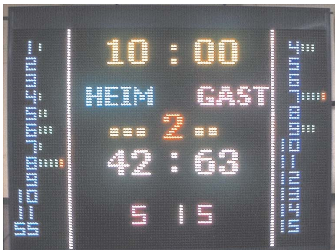
Example: 2,5 m 2 of the system RGBS-15